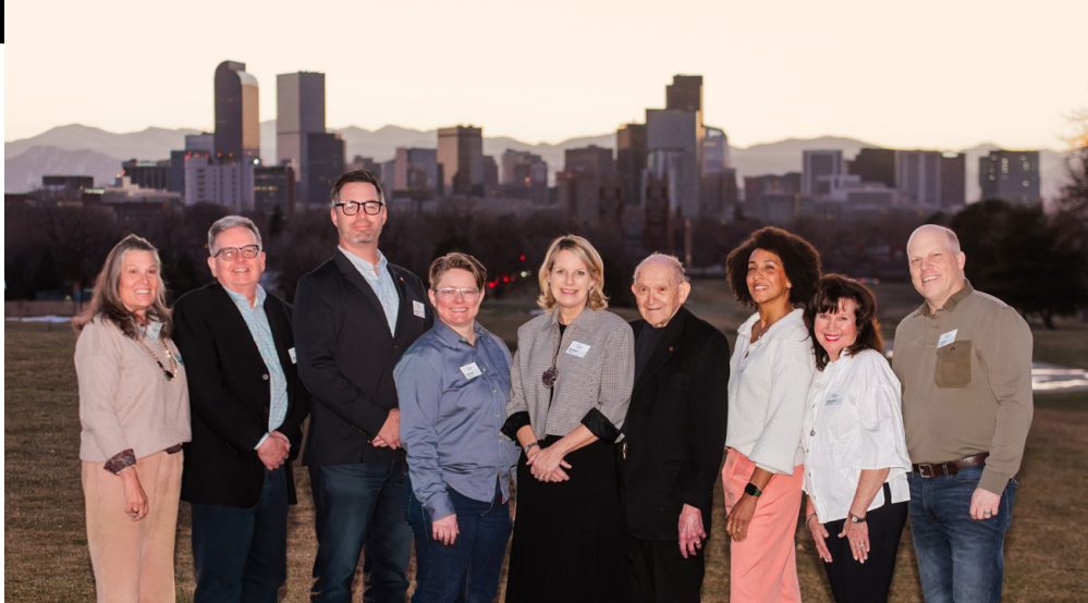
📍 The Unfound Door for the Denver Architecture Foundation