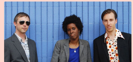
Spherio - Image: Spherio, July 2015, by Tim Nelson. Courtesy of Spherio.