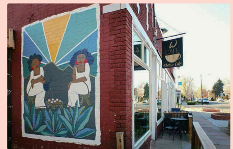
Whittier Café