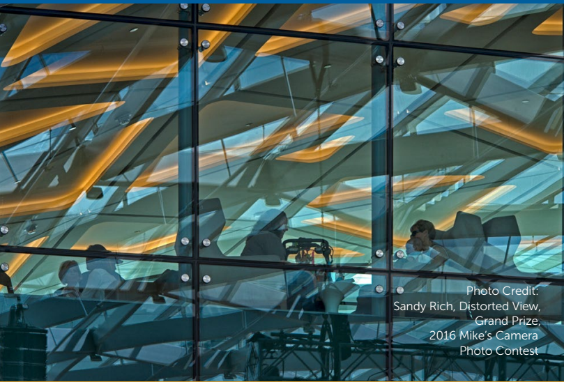
Photo Credit: Sandy Rich, Distorted View, Grand Prize, 2016 Mike's Camera Photo Contest