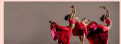
Cleo Parker - Image: From the work Rain Dance, photo by Jerry Mettelus. Courtesy of cleoparkerdance.org.